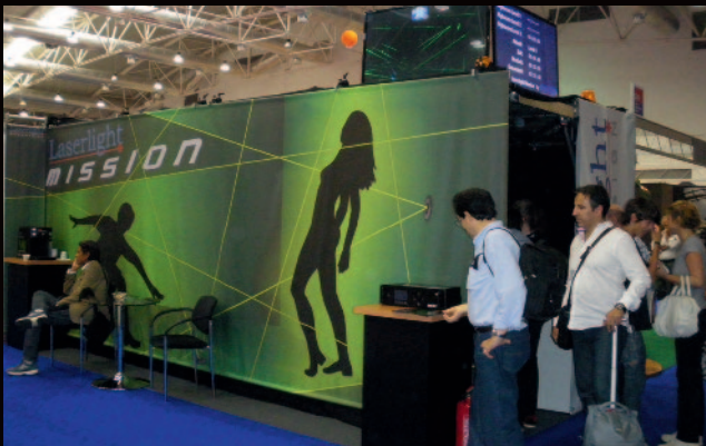
Mobile version of laser game