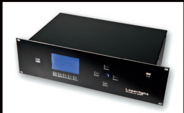
Laserlight ShowServer Multimedia Controller